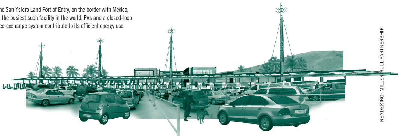
RENDERING: MILLER HULL PARTNERSHIP

The San Ysidro Land Port of Entry, on the border with Mexico, is the busiest such facility in the world. PVs and a closed-loop geo-exchange system contribute to its efficient energy use.