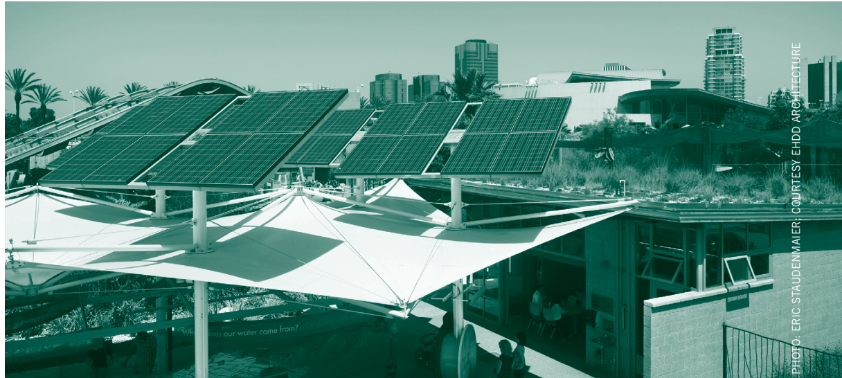
The 2,600-sf Aquarium of the Pacific Watershed Classroom, from the Building Team of EHDD Architecture (designer), structural engineer Rutherford & Chekene, and mechanical/plumbing engineer Rumsey Engineers, employs a living roof, thermal mass, passive heating and cooling, and a 2.8 kW photovoltaic system.

The second stage would be based on the measurement