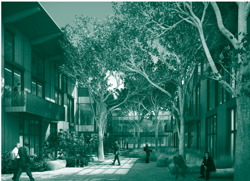
RENDERING: EHDD ARCHITECTURE